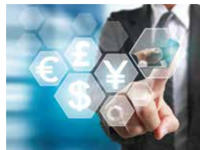
Touch back control Make the touch screen command your laptop, wirelessly