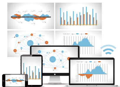
Cross platform wireless presentations Support all OS devices