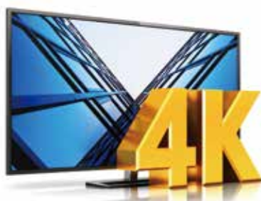
4K resolution Support 4K screen cast