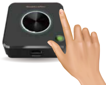
Host control Control the flow of presentations at your fingertips