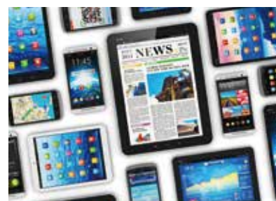
Mobile devices Compatible across all mobile devices