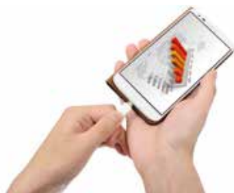
Plug & Play No app required